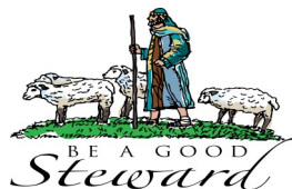
BE A GOOD Steward

Below is the update for the parish on the 2022 Bishop's Annual Stewardship Appeal, captured through March 19, 2023.